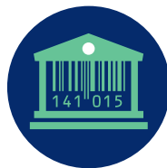
Government & Regulatory Bodies