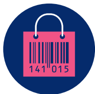
Retail and Consumer Goods