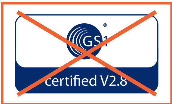
Do not remove GDSN text