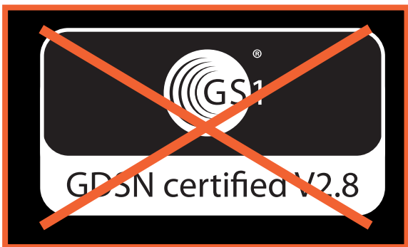
Do not put in negative