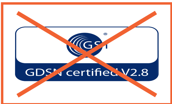
Do not stretch or squeeze