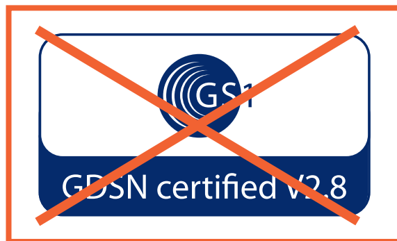
Do not remove Register symbol (®)