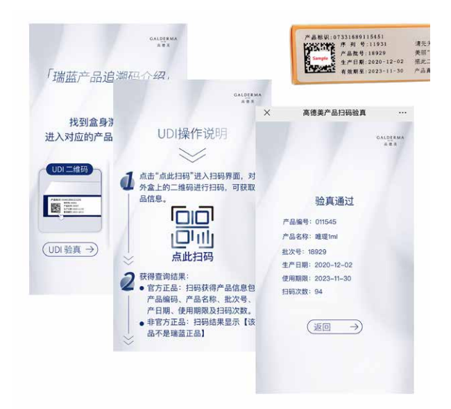
Figure 4: Customer scanning the UDI marking using WeChat app

For distributors that currently use other systems or do not have any traceability system, there is no additional participation cost, and there is no need to carry out complex training for operators. The distributor can also continue to use the existing hardware equipment, such as basic barcode scanning equipment, a handheld PDA terminal, etc, which can transfer data with PTS without purchasing many new equipment.